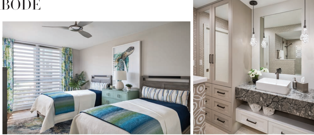
FROM LEFT: THE EN-SUITE GUEST ROOM FOR THE GRANDCHILDREN INCLUDES TWIN TRUNDLE BEDS: THE POWDER ROOM FEA-TURES THE COLORS OF DRIFTWOOD INCORPORATED IN THE CONDO DESIGN PALETTE.

Champagne-like suspended bubbles in the glass sconces, and a vanity chair embroidered on the back with a little shimmer enhance the space's sumptuous vibe.