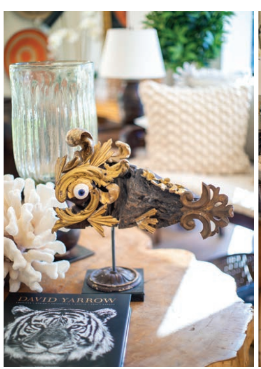
Fine Furnishings & Antiques Lighting | Art | Accessories Garden | Gifts | Jewelry Full Service Interior Design