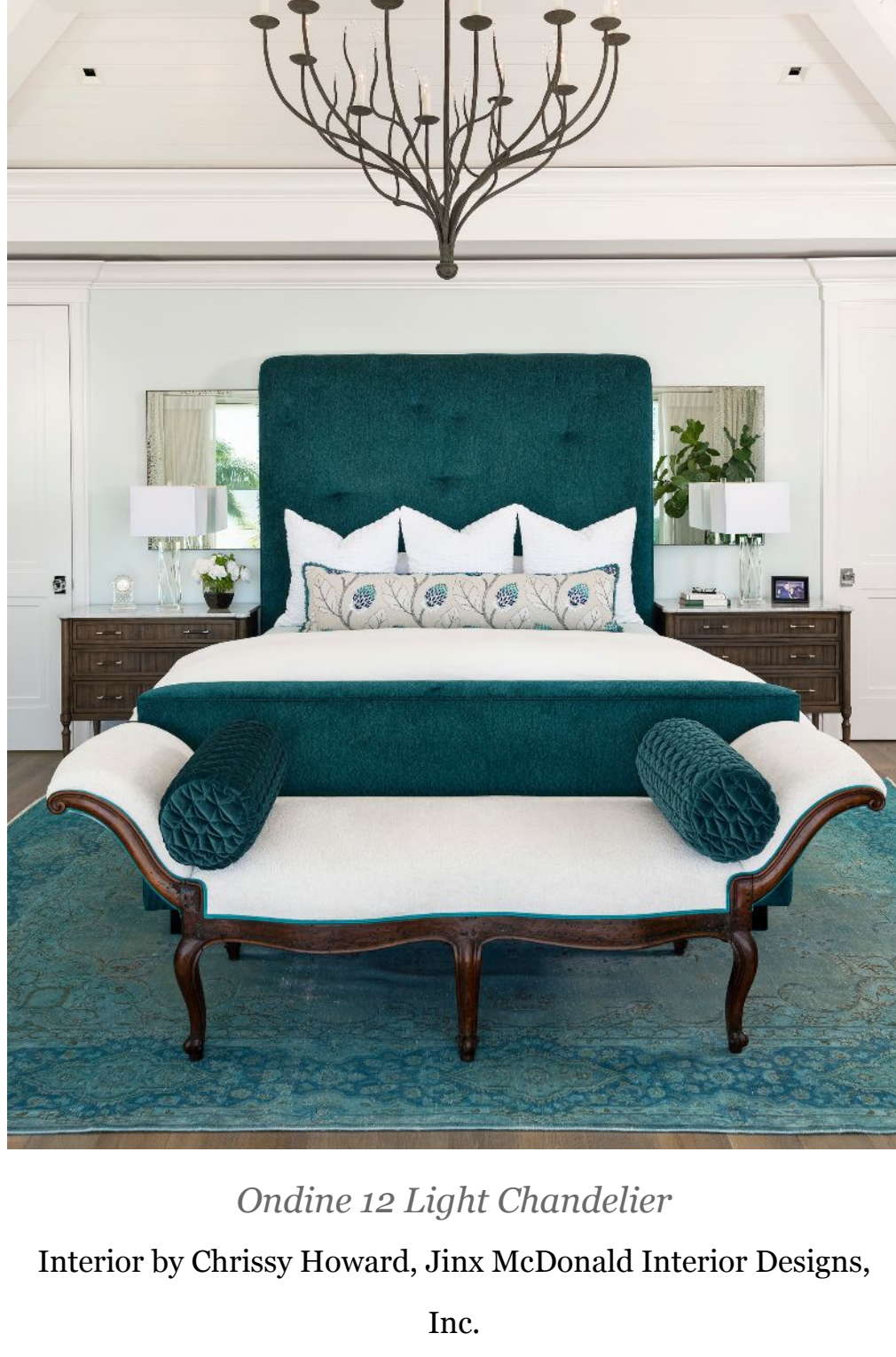
Ondine 12 Light Chandelier